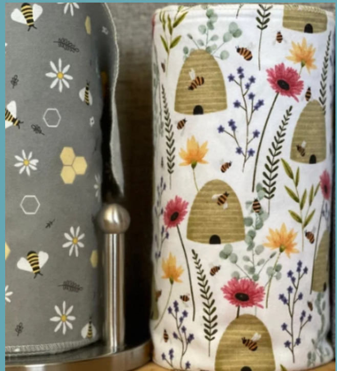
Reusable paper towels

...Or make your own reusables and don't forget to use cloth shopping bags