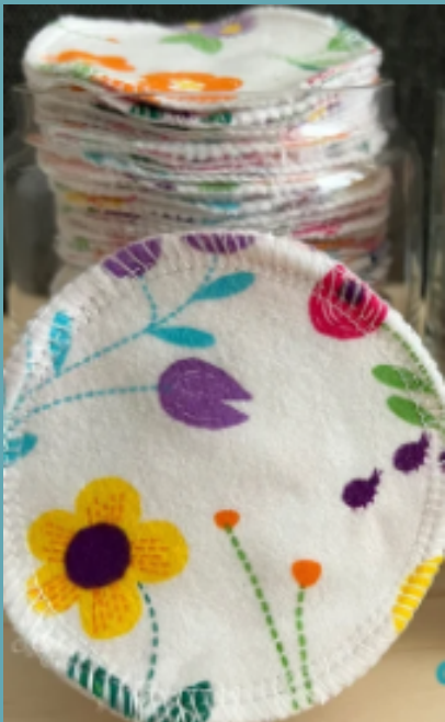
Reusable cotton rounds