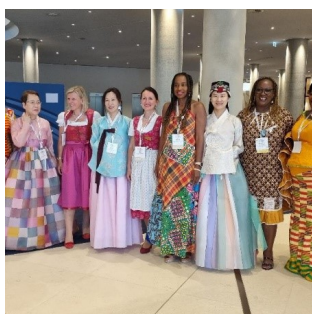
Flag Bearers in National Costumes

Sunday June 26 was the first day with actual business sessions. We started with the flag ceremony in which representatives of all countries with Zonta clubs march in carrying their country flag to be posted on the stage for the duration of the Convention. The USA flag is always first because Zonta was established in the USA. Usually, the flag bearers wear a national costume. This is one of my favorite parts of Convention.