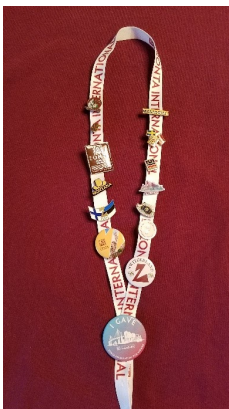
Collecting pins from other clubs is a Convention tradition.

We were all invited to attend the 2024 Convention in Brisbane, Australia and the Convention was closed.