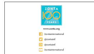
Business Card front (top) back (bottom)