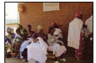
ZI-Sponsored Health Clinic in Rwanda

we collect will be sent to the Zonta International Foundation to assist this program in Rwanda. For more information go to the Zonta International website: www.zonta.org .