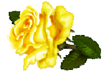
Emmy knows STYLE!!!