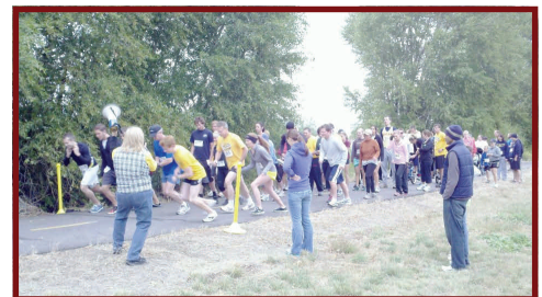
Runners at last years 5k.