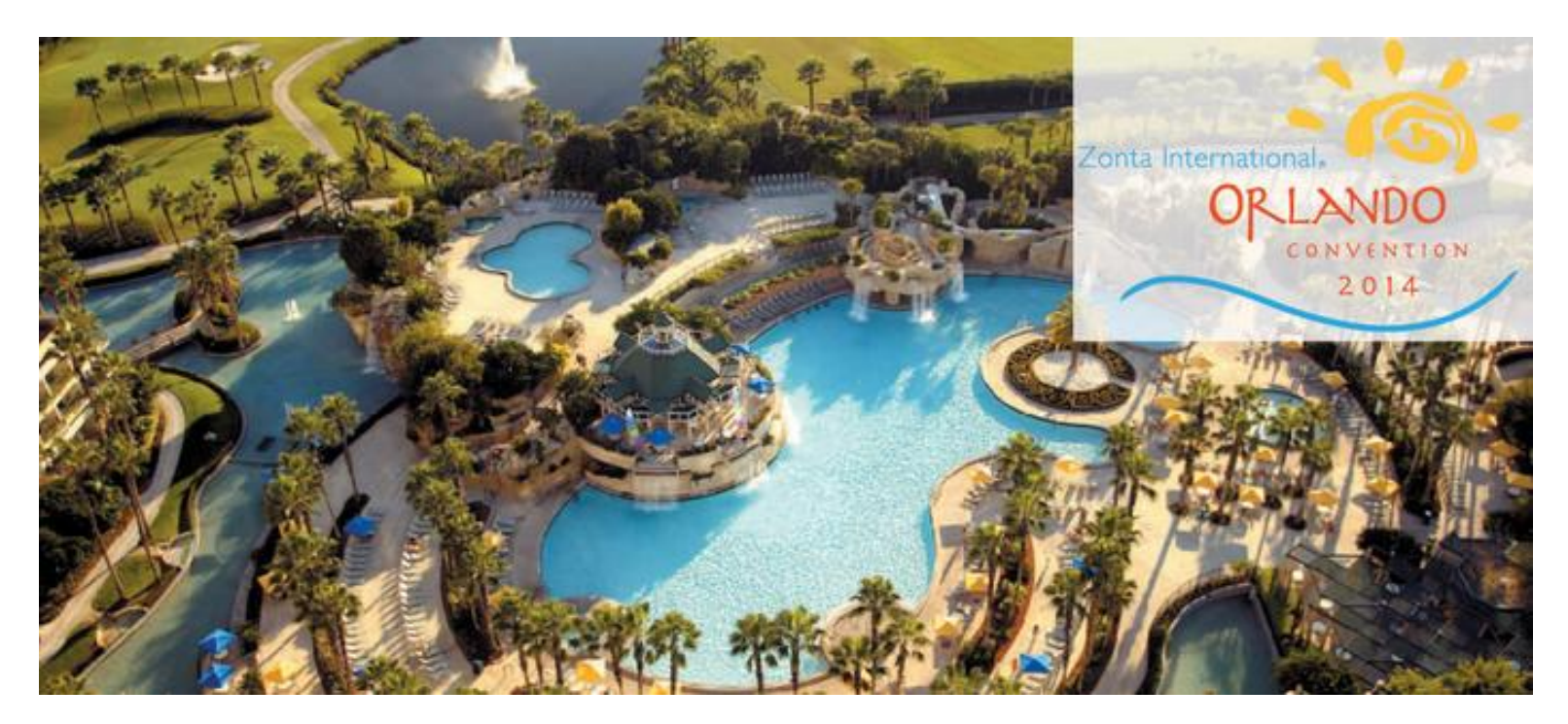
And for the big "Joy in June" – see below