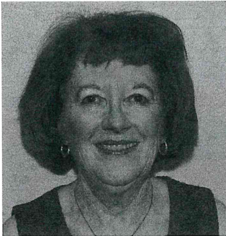
Mary Benoit Foundation Ambassador