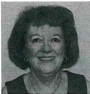
Mary Benoit Foundation Ambassador