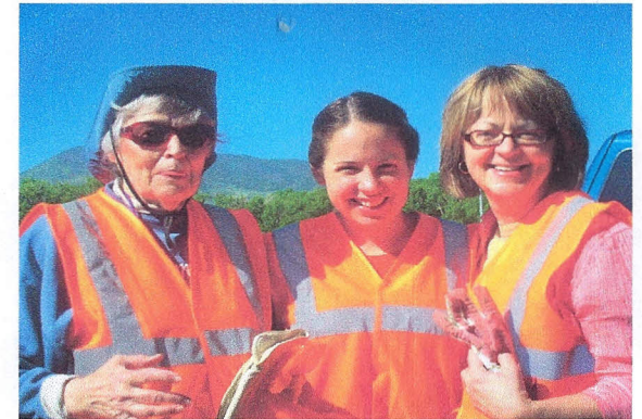
Laramie Zontians Conduct Highway Clean-up

ALIGNED TO THE ZONTA MISSION To Advance the Status of Women And To Make a Difference at the Local and International Level