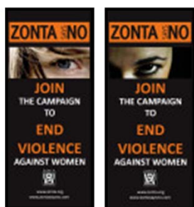
Zonta Says NO Banners