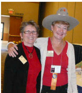
The Pierre-Fort Pierre Club transferred The Traveling Hat to the Denver Club at the District Conference in Spearfish!