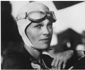
January 11 is Amelia Earhart Day.

This courageous and spirited woman is celebrated by Zontians for her groundbreaking achievements. A Zontian, herself, Amelia Earhart was the first woman to fly solo over the Pacific ocean.