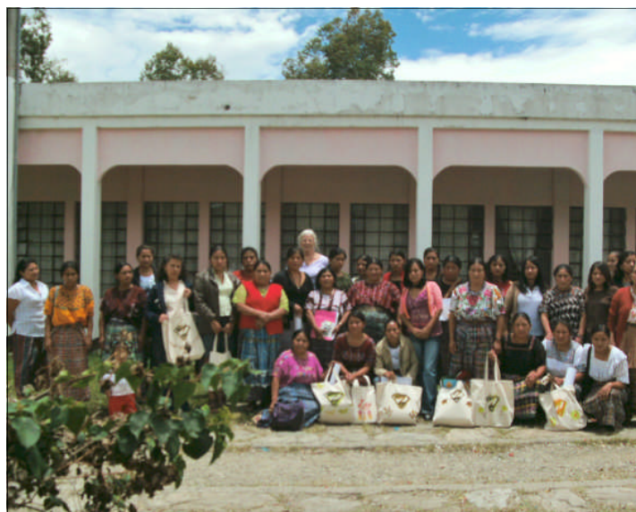
Mayan women and the first shipment of bags!